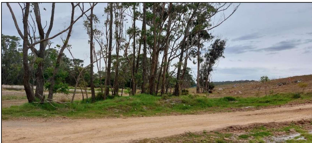
Photo 1: showing stand of non-local Eucalyptus trees and completely degraded understory in Site 1