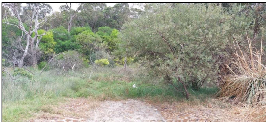
Photo 3: showing large Sydney Golden Wattle with non-local Eucalypts in the background in Site 3.