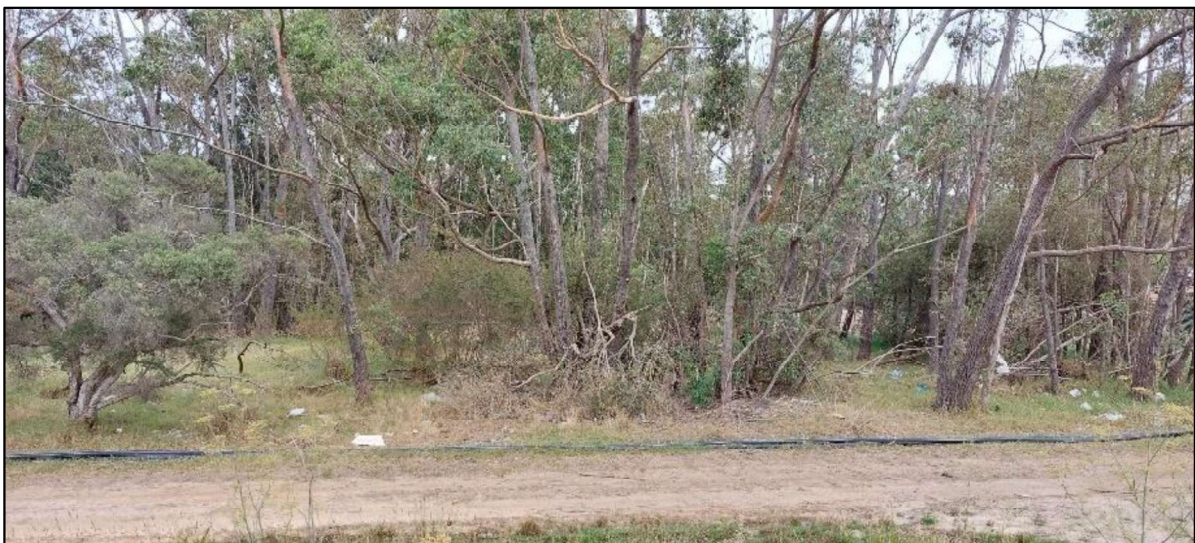
Photo 2: showing dense non-local Eucalyptus trees and Kikuyu understory in Site 2